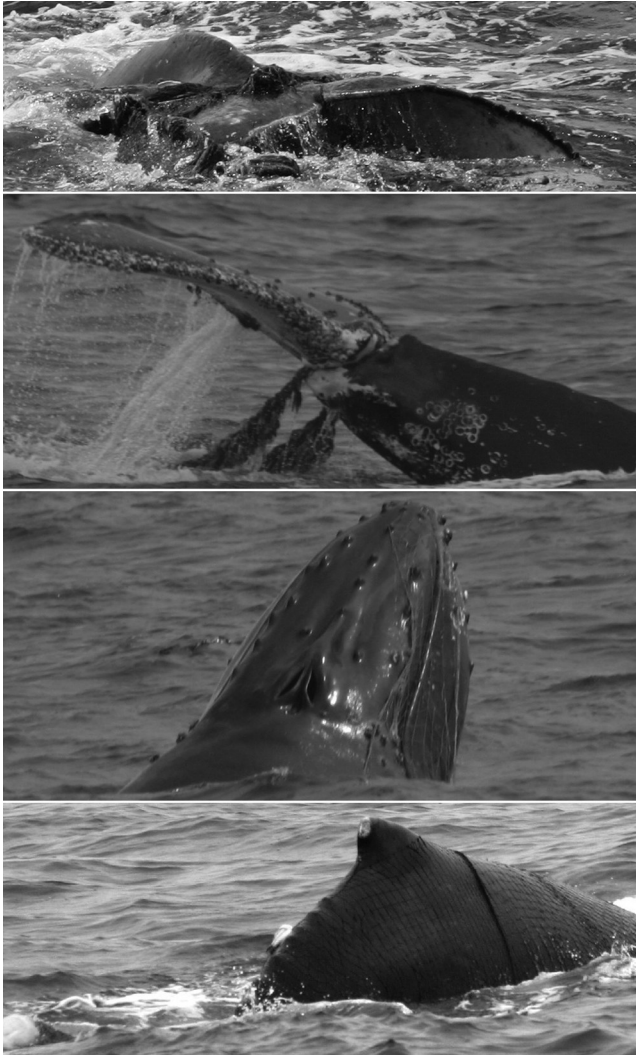
Fig. 6. Whales recorded entangled off Salinas during the 2007 season. The order of the photographs is according to the date of the sighting.

as the right flipper, may also have been compromised. This whale was accompanied by another whale, swimming together but doing short forward breaches and frequently raising its head out the water.