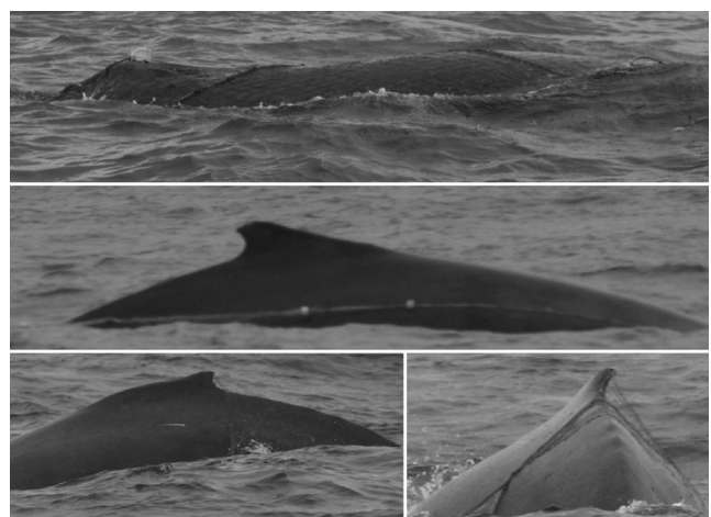
Fig. 3. Whales recorded entangled off Salinas during the 2005 season. The order of the photographs is according to the date of the sighting.

The whale found in June moved slowly and stayed around the same area. It was evident during the observation period