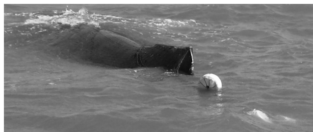
Fig. 5. A severe case of an entangled whale with a net around most of the body.

In the third case, a whale was seen with a net around the right side of its head, although other parts of the body, such