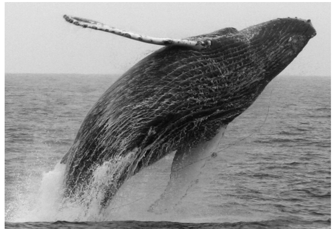
Fig. 2. Breaching whale with a rope hanging from the left side of the body.

12:36, 12:47 and 12:53, which indicate that the rope was tightly fastened to the body. This case of entanglement went unnoticed in the field, despite the group being followed for 48 minutes. Photographs of the whale’s back and right side do not show signs of either rope or net.